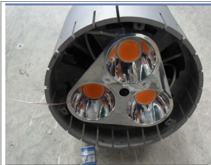
In-Situ Picture - Ts: